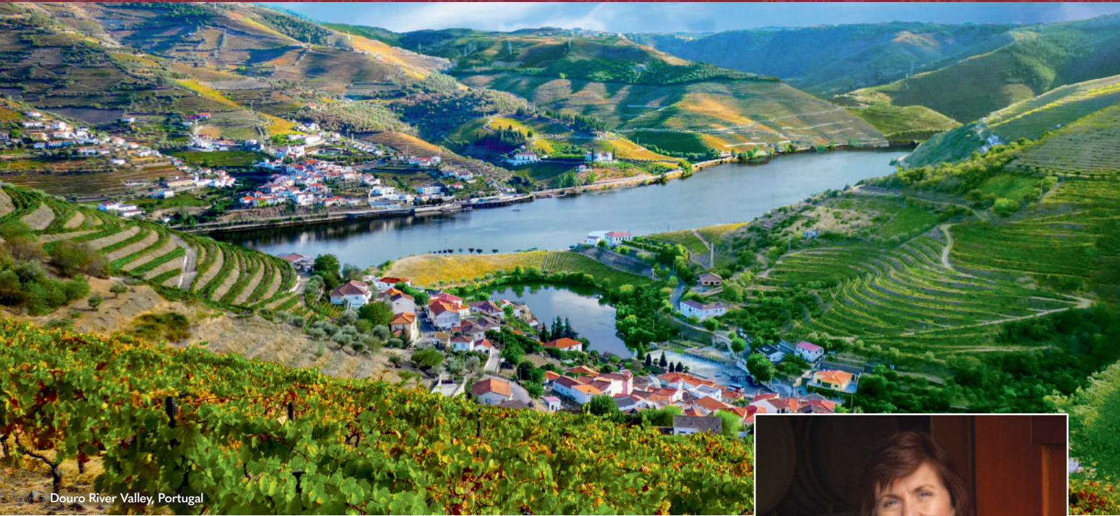
Douro River Valley, Portugal

UNCORK LOCAL TRADITIONS, SAVOR INTENSE FLAVORS AND ENJOY PALATE-PLEASING ADVENTURES DURING AN AMAWATERWAYS WINE CRUISE