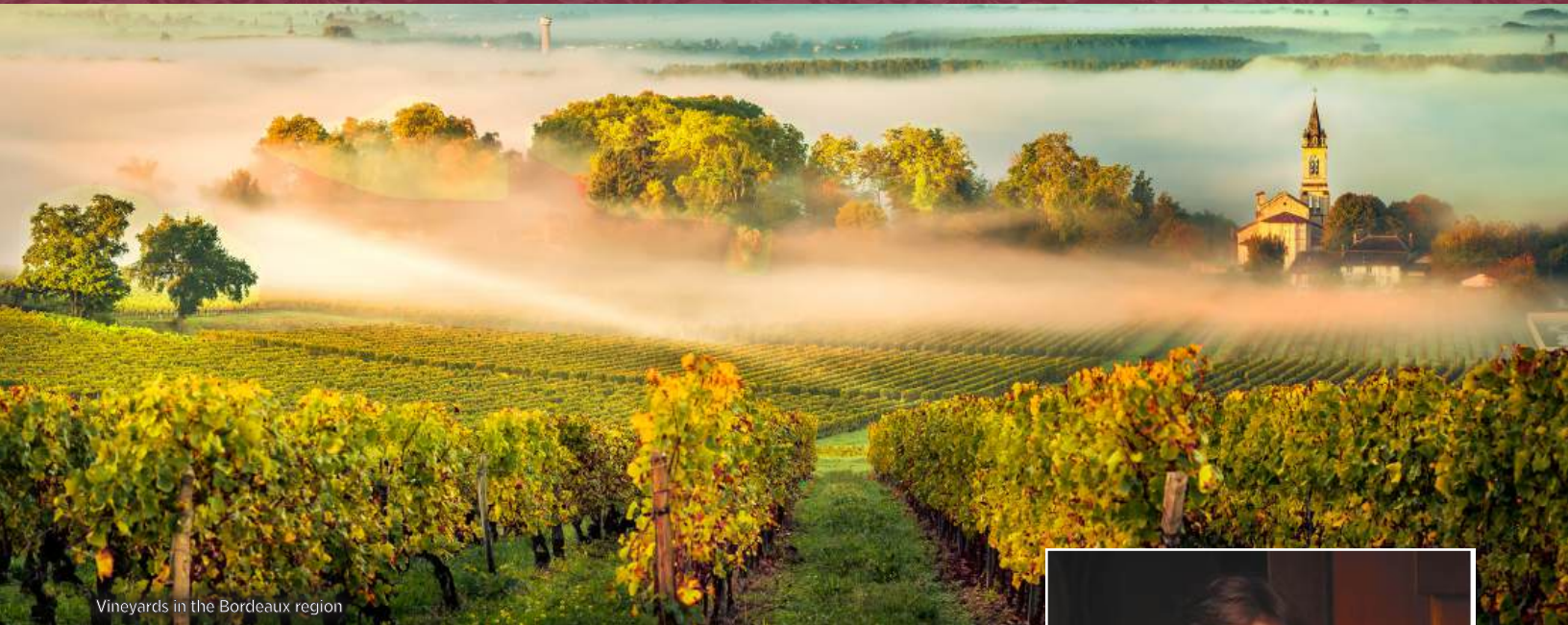
Vineyards in the Bordeaux region

Uncork local traditions, savor intense flavors and enjoy palate-pleasing adventures during an AmaWaterways Wine Cruise